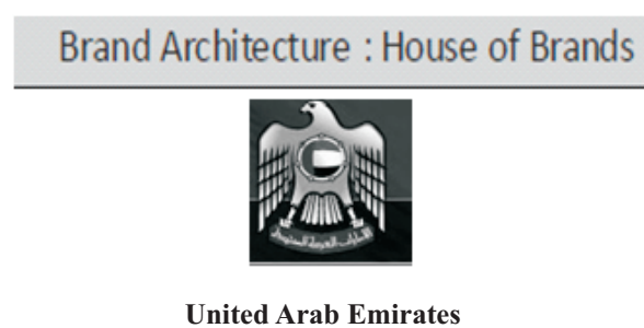
Fig.1. Brand Architecture of UAE – House of Brands

Fig. 1 shows the branding of four out of seven emirates. The rest of the three emirates do not have a very strong branding till date. Otherwise, all the emirates of UAE have their own individual and distinct branding. All the emirates act as a stand alone brand i.e. all the brands are unique in themselves and from their parent brand, UAE. Therefore, brand architecture is more like a 'House of Brands' architecture.