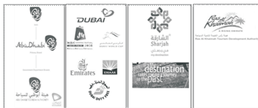
Authors own Interpretation.