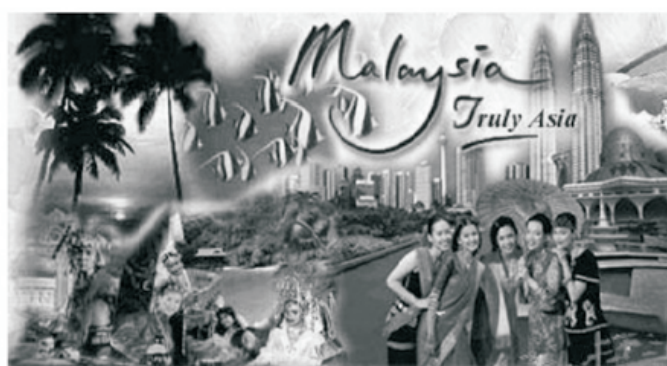
Authors own Interpretation