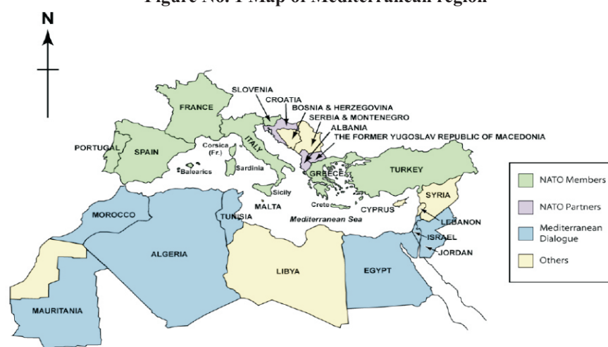
Figure No. 1 Map of Mediterranean region

The Mediterranean Sea is a large sea that is located between Europe, northern Africa and south-western Asia. Its total area is 970,000 square miles (2,500,000 sq km) and its greatest depth is located off the coast of Greece at around 16,800 feet (5,121 m) deep. Due to the large size and central location of Mediterranean Sea, it borders 21 different nations on three continents.