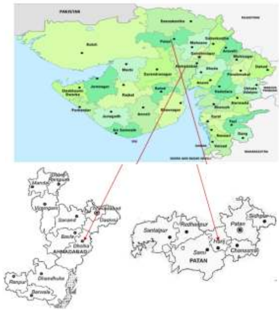
TABLE 2: NAME OF THE DISTRICTS, TALUKA AND VILLAGES

The geographical presentation is done to understand the exact location of the taluka in the Gujarat state.